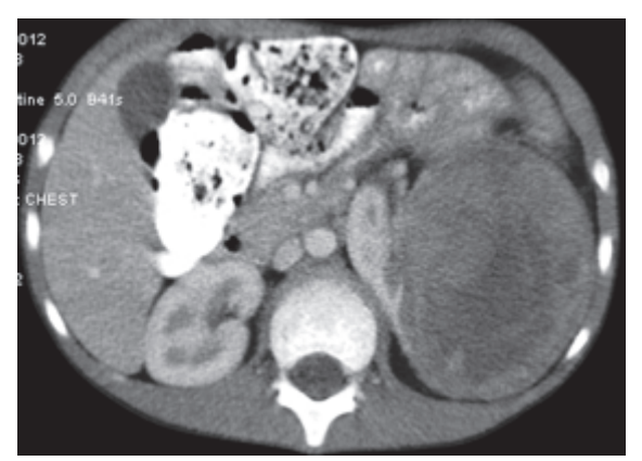
Fig. 1. Abdominal computed tomography, showing a large solid mass arising from the upper-middle part of the left kidney and extending into the inguinal area, with necrotic and cystic areas

pleura, mediastinum, adrenal gland and, in particular, the spleen and liver in HS. EMH may occur due to hematogenous spread of hematopoietic stem cells or activation of hematopoietic stem cells in other sites, or as a