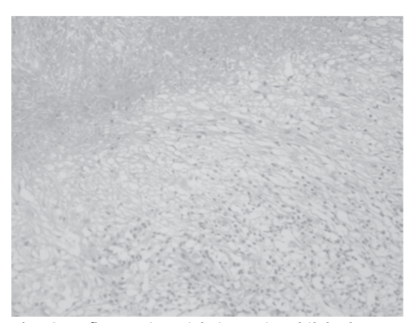
Fig. 2. Inflammation rich in eosinophil leukocytes surrounding the granuloma (hematoxylin & eosin [HE], original magnification X100).