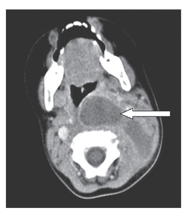
Fig.3 . CECT scan showing left-sided retropharyngeal abscess (arrow) with airway compression (patient 6 in the Table).

Imaging techniques are the cornerstone in the evaluation of DNIs. The most common diagnostic techniques used for this purpose are USG and CECT. As CECT has many advantages in demonstrating the relationship between the abscess and important structures, such as major vessels, and in planning surgical drainage, it is the most appropriate and widely used imaging technique for DNIs<sup>13</sup>. CECT provided additional information in half of our patients, revealing airway compromise and collections that could not be visualized sufficiently in the involved area with USG. We suggest that USG might not be good for diagnosing and identifying the location of DNIs. CECT should be used in the presence of DNI suspicion or airway compromise.