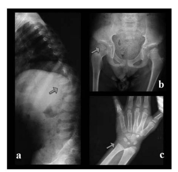
Fig. 2. Dysostosis multiplex (a. Vertebral beaking, b. Shallow acetabulum and c. Mild hypoplasia of medial distal radius, and mild cortical tinning of metacarpal bones) on X-ray.

distinction, historically two clinical subtypes of fucosidosis have been delineated. Type I is the rapidly progressive form, beginning before one year of age, leading to rapid neurological deterioration, seizures, growth retardation and visceromegaly. Death occurs in the first decade. Type II is the slowly progressive form, with onset usually before age two and a slower advance of neurologic deterioration, spasticity and angiokeratomas. Most individuals survive to ages 20-40. Type I and type II fucosidosis represent the extreme poles of a continuous clinical spectrum. Williams et al.3 reviewed findings of 77 fucosidosis patients; 17 of 77 cases were symptomatic before age one, and 14 of these individuals died before age 10. No associations exist between disease severity and