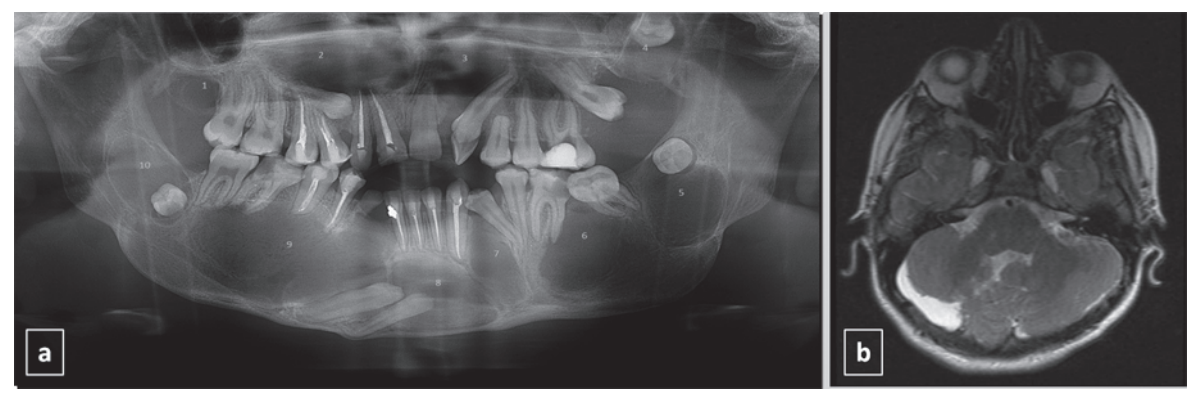
Fig. 1. (a) Multiple odontogenic keratocysts on a panoramic radiograph. (b) Vermian dysgenesis.

The odontogenic keratocysts that accompany this uncommon syndrome exhibit biological aggression and high risk of recurrence due to the high mitotic epithelial activity and frequency of satellite cysts<sup>9, 10</sup>. Treatment of the keratocysts varies from enucleation with peripheral osteotomies to resections<sup>11, 12</sup>. If the treatment of odontogenic keratocysts is neglected, the cysts may develop into severe complications such as jaw fractures or migration or mobilization of the teeth. Therefore, patients should be informed about the significance of odontogenic keratocysts and the likelihood of the development of further cysts.