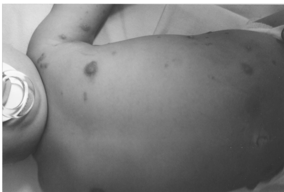
Fig. 1. Multiple red-brown macules and papules on the trunk of a 10-month-old child.