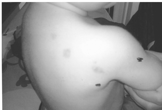
Fig. 4. Neutrophil leukocytes in the stratum corneum, small parts of parasites, and exudate in the hyperkeratotic crust (HE, x200).