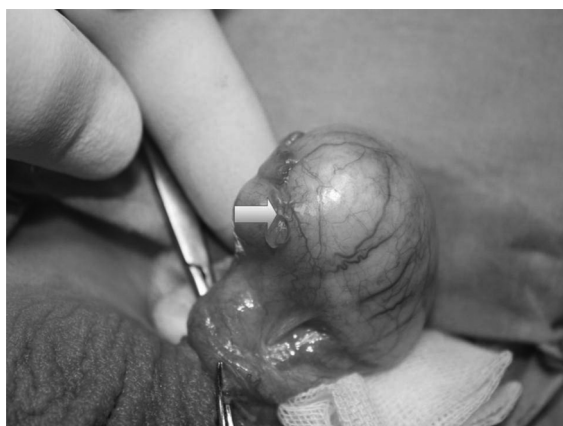
Fig. 2. Intraoperative view of a patient with torsion of EC (Arrow: epididymal cyst).

left EC torsion, and the torted cyst was excised with a trans-inguinal approach 15 . The second case of EC torsion was in a six-month-old male 16 . Apart from aplasia of the vas deferens, surgical exploration of the baby revealed a 2 cm pedunculated cyst arising from the tail of the left epididymis, and the stalk was found to be twisted 360°. The third pediatric case of EC torsion was a 13-year-old boy with a history of scrotal trauma before admission to the hospital 17 . Surgical exploration of the left hemiscrotum showed a 720° medially-directed torsion of an EC, and histologically, the cells of the epididymal duct were found to be necrotic in that case 16 . The presented child in this study is probably the fourth case of pediatric EC torsion. To our knowledge, this is the first report of a child known to have EC previously who was followed conservatively until the occurrence of EC torsion. The histopathological examination revealed a 4 mm unilocular cyst covered by one layer of cuboidal epithelium, compatible with EC. No sperm cells were detected, and there was no necrosis in the cells of the epididymal duct. Reported cases in the literature and the current patient had torsion of ECs located within the left epididymis. To our knowledge, no cases of EC torsion within the right epididymis have been reported.