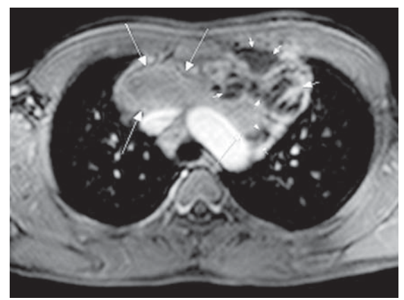
Fig. 2. Before treatment, thorax MRI in axial T1-weighted fat-suppressed contrast-enhanced image. The mass lesion is seen as high signal intensity due to contrast enhancement (long arrows), while the lymphangioma component is seen as hypointense due to cystic content (small arrows).

Combination of CT and MRI can be helpful in characterizing the cystic contents and anatomic relationships of the cysts. However, MRI delineates the tumor lesion extension