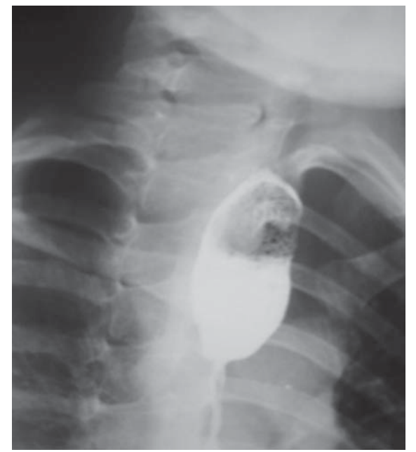
Figure 1. Barium esophagogram showing tight stricture of the mid-esophagus.

presence of oral erosions and blisters on her lips, we did not use classical endoscopic bite guard but instead gently placed two airways on both sides of her jaw, thus opening her mouth sufficiently for passing the endoscope (Olympus GIF Q180). Esophagoscopy showed almost complete esophageal occlusion and endoscopic signs of esophagitis in the form of non-confluent white exudates (Fig. 2). Three sessions of fluoroscopically guided esophageal balloon dilatation using a balloon catheter (Medi/Tech/Boston Scientific) were done. Under fluoroscopic guidance, a guidewire with soft tip was introduced through the nostrils and positioned in the stomach. A balloon catheter (6 mm) was then placed across the stricture and slowly inflated with contrast for 30 seconds. Balloon catheter size was increased by 2 mm for subsequent sessions. The interventions were performed without any complications. Both endoscopic and radiologic procedures were done in deep sedation achieved with midazolam. The patient took esomeprazole for four weeks after balloon dilatation and was symptom-free during that period. Due to the possibility of esophageal stenosis recurrence, her regular follow-up visits to our outpatient department have been continued.