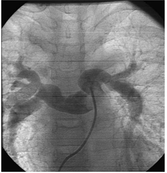
Fig. 3. Angiographic evaluation revealed multiple sequential dilatations in the distal parts of both pulmonary arteries.

In all ATS patients, the results of collagen type I and type III biosynthesis studies were normal on skin fibroblasts<sup>6-8,12</sup>. Histologic findings on autopsy of two affected children showed arterial changes with disruption of elastic fibers of the media and fragmentation of the internal elastic membrane as well as mucosal and transmural necrosis of the stomach, small bowel and colon and extensive necrosis of the liver<sup>5,6</sup>. The constellation of abnormalities suggests a genetic syndrome of connective tissue etiology<sup>1-14</sup>.