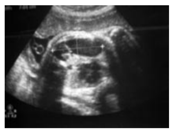
Fig. 1. Prenatal ultrasound scan of the lung mass.

On physical examination, she was noted to have microphthalmia, aniridia, hypotelorism, low-set ear, postaxial polydactyly on the hands, rocker bottom feet, and single umbilical artery (Figs. 2, 3). The neonate, who had tachypnea, nasal flaring, cyanosis, and retractions, was intubated. She was administered dopamine, as the filling period of the capillary was long and she suffered hypotension. Echocardiography revealed secundum atrial septal defect (ASD), tricuspid deficiency and increased pulmonary artery pressure. She was normal except for TORCHES serology, toxoplasmosis, cytomegalovirus, and rubella Ig G positivity.