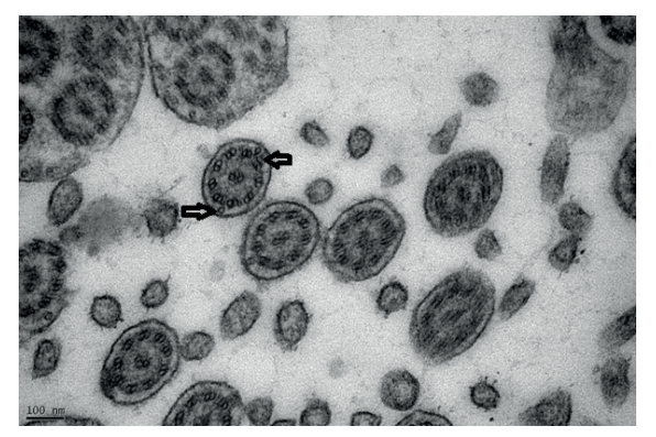
Fig. 2. In the sample of a patient, cilia ultrastructure was observed: The central and peripheral microtubule structures (9 + 2) were not in the normal structure with extratubules (marked by arrow) located in the periphery; electron micrograph (X100000 magnification; Uranyl acetate & Lead citrate).

HSVM: high speed videomicroscopy, IF: immunofluorescence