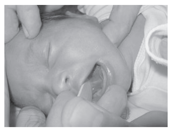
Fig. 2. Purulent exudation from the Wharton's duct.

On admission, the total white blood cell count was 19,000/mm<sup>3</sup> (64% neutrophils, 26% lymphocytes, 6% monocytes, and 4% stab).