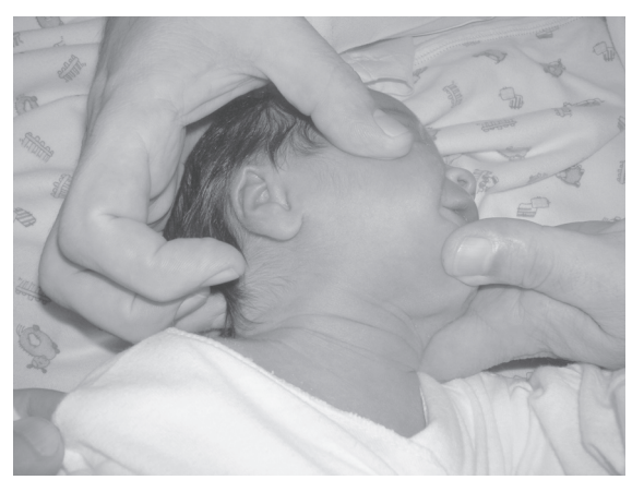
Fig. 1. Neonate with submandibular swelling.

Her weight was 2700 g on the day of admission. A firm, tender, erythematous swelling about 2x1 cm in diameter was noticed at the right submandibular region (Fig. 1). There was no evidence of erythema, swelling or tenderness in either parotid region. The infant was afebrile. Purulent exudate exuded from the Wharton's duct when pressure was applied to the gland (Fig. 2). Her vital parameters and hydration status were normal. Her examination was otherwise unremarkable.