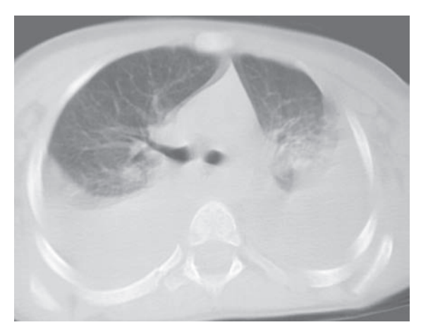
Fig. 2. Computed tomography of the chest shows bilateral massive pleural effusions.

cells but no microorganisms. Conservative treatment for chylothorax with nothing by mouth and total parenteral nutrition (TPN) was instituted. Cranial computed tomography showed diffuse cerebral edema, which resolved following appropriate anti-edema treatment. On secondary trauma work-up, fracture of tibial epiphysis was diagnosed and managed by the orthopedic surgeon. The chest tube drainage gradually decreased from 100 ml/day to less than 20 ml/day in four days and had completely ceased on the fifth and seventh days on the right and left sides, respectively. Since then, a regular diet was initiated and thoracostomy tubes were removed. He was discharged on the 10th day uneventfully. He was doing well at the first- and sixth-month follow-up visits.