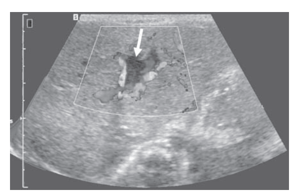
Fig. 2. Color Doppler shows umbilical vein varix and thrombus (arrow).

The Turkish Journal of Pediatrics • September-October 2009