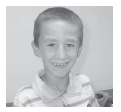
Fig. 1. Frontal view of the patient at 8 years showing triangular face, frontal hair upsweep, mildly prominent metopic suture, broad eyebrows, broad nasal bridge and bulbous tip of nose, crowded teeth, and large ears with attached ear lobules.

Physical examination showed height 118 cm (3-10<sup>th</sup> centile), weight 25 kg (25-50<sup>th</sup> centile), and occipito-frontal circumference 50 cm (<3<sup>rd</sup> centile). Microcephaly, brachycephaly, upsweep of frontal hair, mildly prominent forehead, triangular face, broad evebrows, broad nasal bridge, bulbous tip of nose, prominent columella, crowded teeth, and attached ear lobules were noted (Fig. 1). Bilaterally second fingers deviated to the ulnar side, the fifth finger of the left hand had clinodactyly, and fifth toes also had mediodorsal curve bilaterally. He had gait ataxia and his cognitive functions were severely impaired. Magnetic resonance imaging (MRI) showed an arachnoid cyst found in the posterior cerebellum. The EEG and metabolic screening tests were normal. Routine biochemical and hematological tests were also normal.