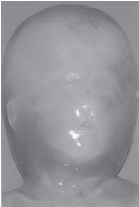
Fig. 1. The face of the fetus with hypotelorism, cleft lip, flat nose with a single nostril and low-set ears.

preparation techniques yielded a normal karyotype 46, XY. Based on sonographic findings, the parents decided to terminate the pregnancy and the fetus was delivered at the 16 th gestational week. An autopsy was performed. It was a male fetus whose growth was appropriate for gestational age: body weight was 109 g (N: 108 \pm 25 ), crown-rump distance was 12 cm (N: 12 \pm 1.1 ) and toe-heel distance was 2.5 cm (N: 2.1 \pm 0.2 ). He had dysmorphic features such as hypotelorism, central cleft lip, a flat nose with a single nostril and low-set ears (Fig. 1). There was postaxial polydactyly with six fingers in all four extremities, clinodactyly of the 6 th fingers and left pes equinovarus (Fig. 2). The halluces were wide, but not bifid, and the X-ray was normal. Central nervous system investigation revealed semilobar holoprosencephaly with severe hydrocephaly (Fig. 3). Heart was normal with intact interventricular septum. An additional finding was the presence of two lobes in the right lung.