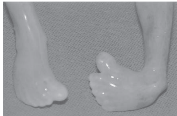
Fig. 2. Postaxial polydactyly and left pes equinovarus.

Parental karyotypes, performed on GTG-banded metaphase spreads prepared from phytohemagglutinin (PHA)-stimulated peripheral blood lymphocytes after standard culture and chromosome preparation techniques were normal.