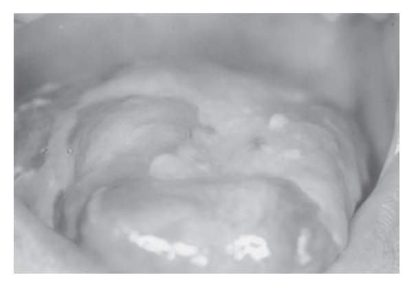
Fig. 2. Evident leukokeratosis on the dorsum and sides of the tongue.