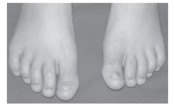
Fig. 7. Longitudinal ridging accompanied by distal dystrophy of the nails.