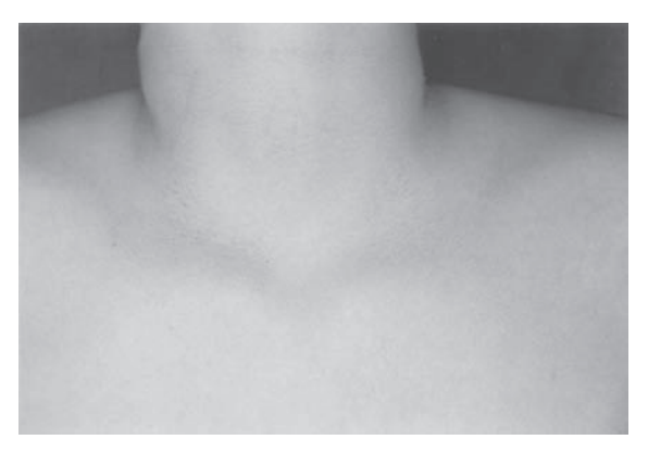
Fig. 6. Reticulated hyperpigmentation and atrophy on the neck and V area of the chest.

The Turkish Journal of Pediatrics • November - December 2008