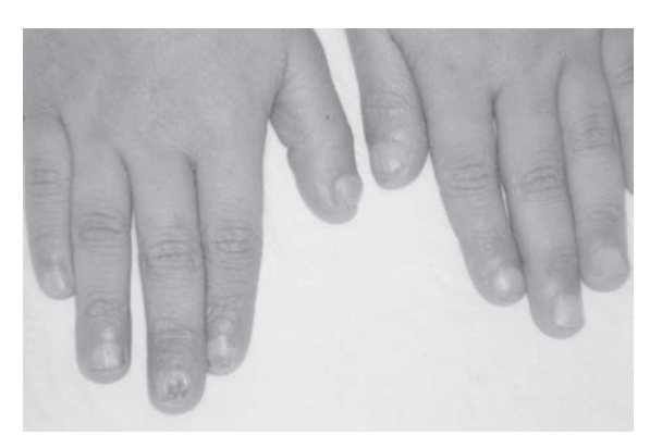
Fig. 1. Dystrophic fingernails observed in Case 1.