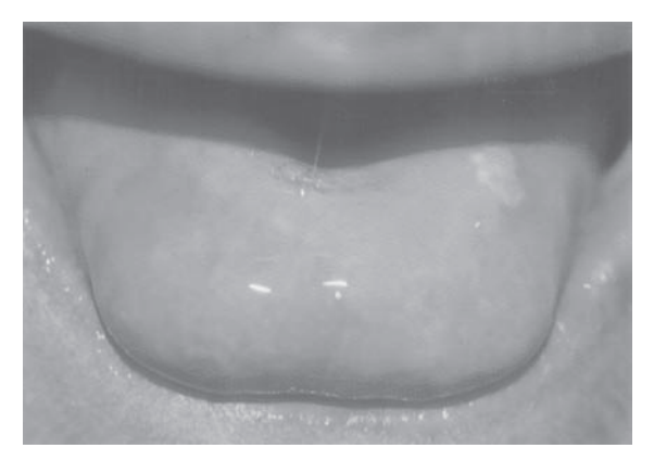
Fig. 5. Leukokeratosis on the dorsum and sides of the tongue 7 years after the first admission of Case 1.

after the follow-up visit one month later when his hemoglobin was found to have reached 12.2 mg/dl.