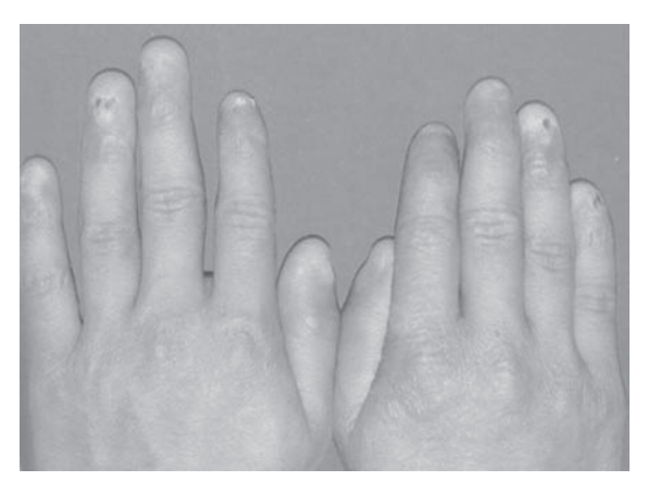
Fig. 4. Dystrophic fingernails 7 years after the first admission of Case 1.

Treatment with 30 mg/kg prednisolone orally was considered for his anemia, which had been gradually tapered and was discontinued