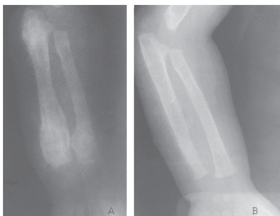
Fig. 2. a) Initial X-ray of right forearm shows osteolytic lesions consistent with osteomyelitis. b) Normal X-ray findings after treatment.

Laboratory evaluation revealed a hemoglobin level of 11 g/dl, white blood cell (WBC) count of 19,000/mm 3 , sedimentation rate of 90 mm/hr and C-reactive protein of 6.6 mg/dl. Peripheral blood smear showed 54% polymorphonuclear leukocyte (PNL) and 46% lymphocyte. Immunoglobulins, cellular immunity tests (CD19, CD3, CD4, CD8, NK and active T lymphocytes), Burst test, and complement level and adhesion molecules of CD11a, CD18 were normal. Human immunodeficiency virus serology was negative. Plain roentgenogram of the distal metaphysis part of the radius and ulna revealed osteolytic lesions consistent with osteomyelitis (Fig. 2).