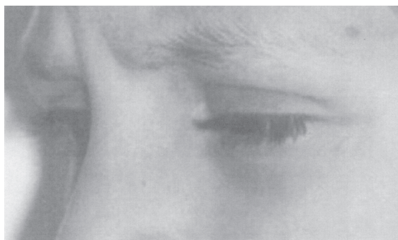
Fig. 1. b) Appearance on the seventh day of treatment.

The mass on the left upper eyelid of the child disappeared on the seventh day of treatment (Fig. 1b). After induction therapy, no pulmonary or kidney lesions were observed. He currently has been off treatment for 30 months and is free of the primary disease.