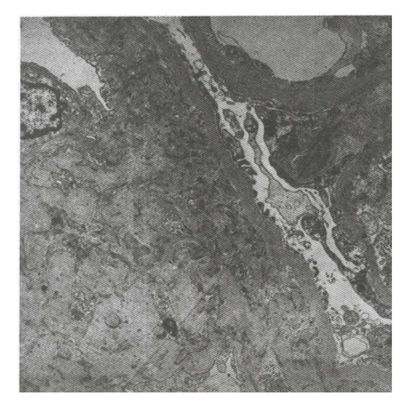
Fig. 2. Gross thickening of the glomerular basement membrane and increased mesangial matrix demonstrated on electron microscopy (magnification x8800).

Diabetic nephropathy is a clinical condition characterized by persistent proteinuria, decline in glomerular function, hpertension, and progression to end-stage renal disease. Among the complications of type 1 diabetes, nephropathy is the major life-threatening one<sup>5</sup>. Our patients was unusual in that a persistent overt proteinuria was documented in the prepubertal age with no