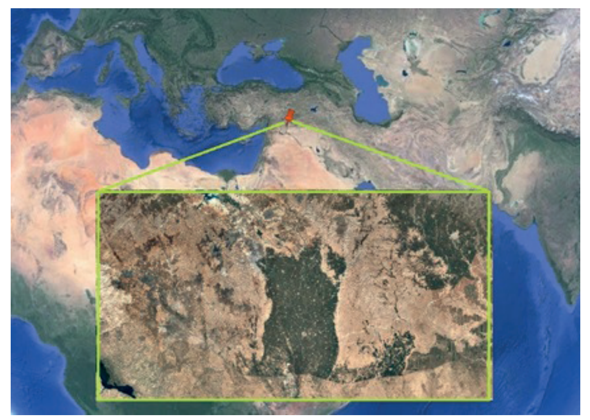
Fig. 1. Study location (the red maker indicates intensive pesticide application area).

The study was conducted in Harran city of Şanlıurfa province, southeast Turkey, between June and August 2016. Cotton farming is one of the main sources of livelihood in Şanlıurfa province. As mentioned previously, the research was conducted with children living in the following 4 villages scattered over an area of 40 km<sup>2</sup>: Giyimli (N36.56 E39.00), Küçük Minareli (N36.55 E39.00), Büyük Minareli (N36.56, E38.09) and Bozyazı (N36.51, E39.05). The children were evaluated before the application of the pesticides (Fig.1). Pesticide application was conducted over a time interval of 10-12 d. The application started in the third week of June and continued until the end of August. Tractors with agricultural sprayer machines were used for pesticide spraying.