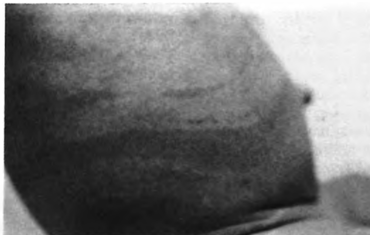
Fig. 1b. Hypopigmented leaf-shaped patches on the lateral aspect of the case.