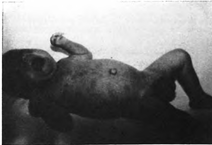
Fig. 1a. Hypopigmented leaf-shaped patches with midline separation on the front of the patient (printed with written permission from the patient's parent).

Electroencephalogram demonstrated hypsarrhythmia. The characteristic clinical and electroencephalographic features favored the diagnosis of West's syndrome. The seizures responded to adrenocorticotrophic hormone and valproate treatment. On his follow-up, he died from pneumonia at eight months of age.