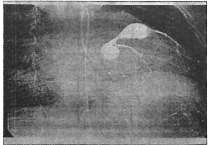
Fig. 2a. Coronary artery angiography demonstrating aneurysm formation in left anterior descending artery without any stenotic lesion.

detecting aneurysms in the proximal portions of both the right and left coronary arteries, and is useful in selecting patients for invasive investigation with selective coronary arteriography 5 . In a recent study of 594 patients with KD, 24.6% were diagnosed as having coronary aneurysms, and during follow-up, ischemic heart disease developed in 4.7% and myocardial infarction in 1.9%. Death occurred in 0.8%. The 448 patients with normal findings at the first angiogram subsequently never developed any abnormal cardiac findings 6 . It is important to treat the localized stenosis in preventing myocardial infarction in the chronic phase of KD. Since coronary angiography is an invasive