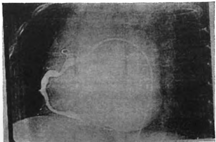
Fig. 2b. Coronary artery angiography demonstrating aneurysm formation in the right coronary artery without any stenotic lesion.