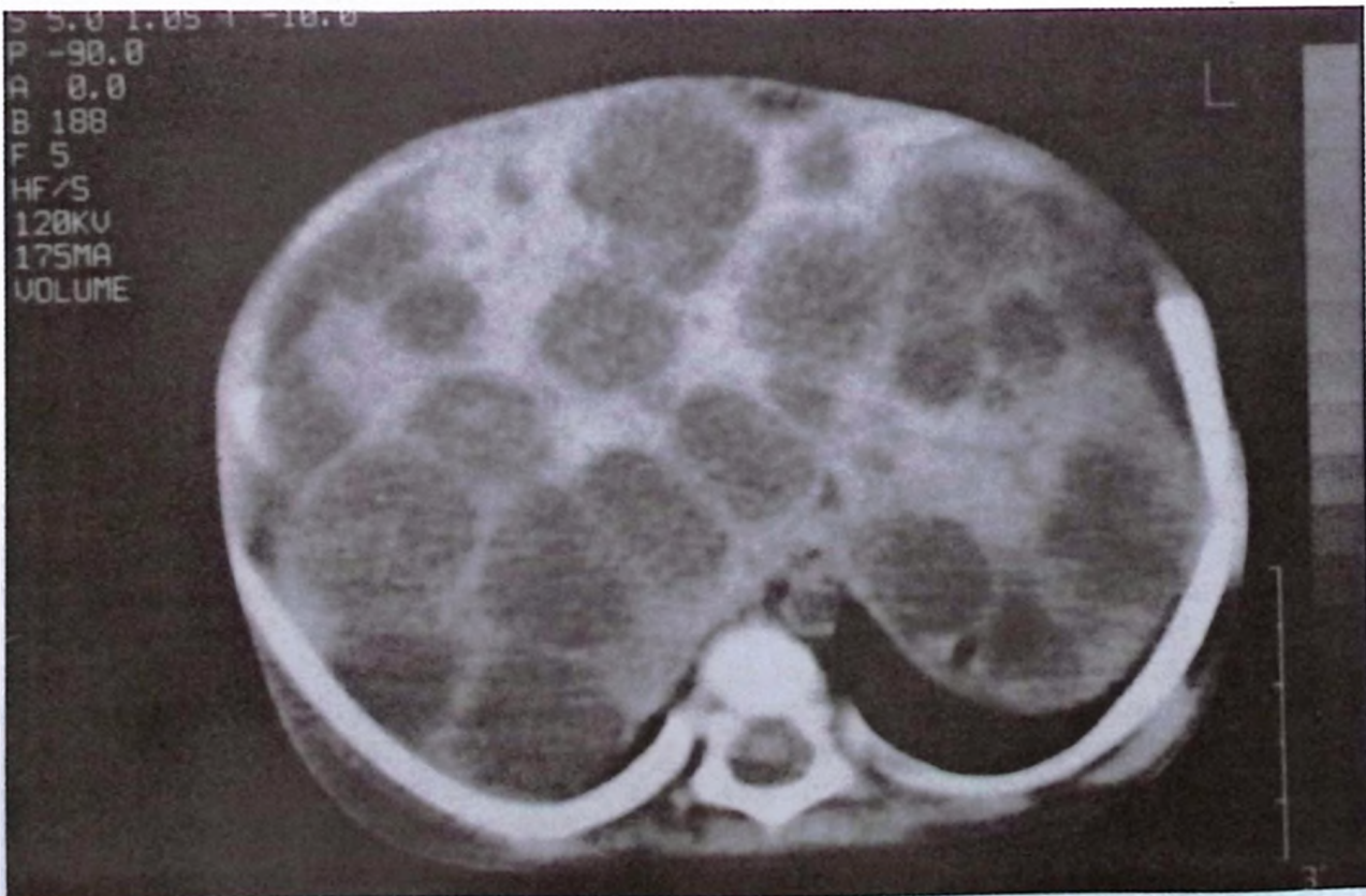
Fig. 2. Computerized tomography shows multiple metastatic lesions in the liver.