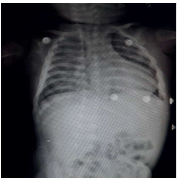
Fig. 1. Bilateral perihilar infiltrations were seen on the Chest x-ray.

the upper lobes in both lungs, and those findings were evaluated as possible COVID-19 (Fig. 2). HLH 2004 treatment protocol was continued considering the possible HLH reactivation in the patient with persistent fever and hyperferritinemia and hypertriglyceridemia. Cyclosporine, dexamethasone and intravenous immunoglobulin (IVIG) were given. An oronasopharyngeal swab sample was taken.