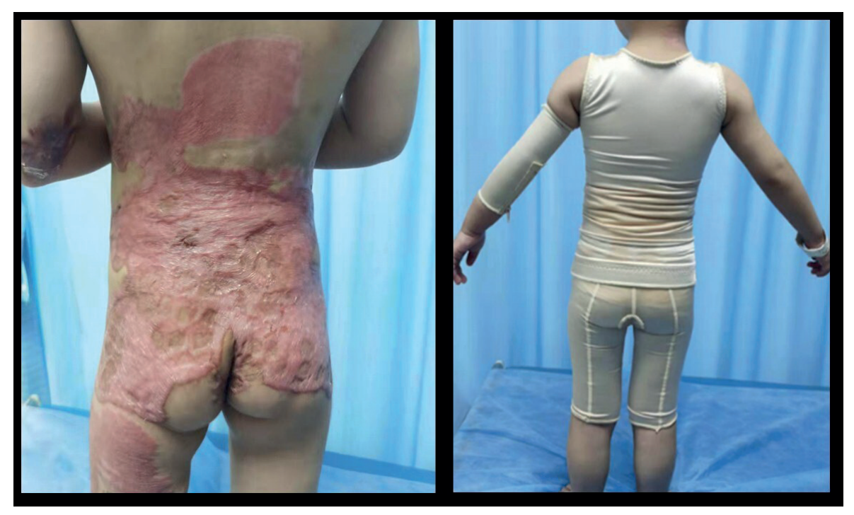
Fig. 3. Scar management and rehabilitation after wound healing.