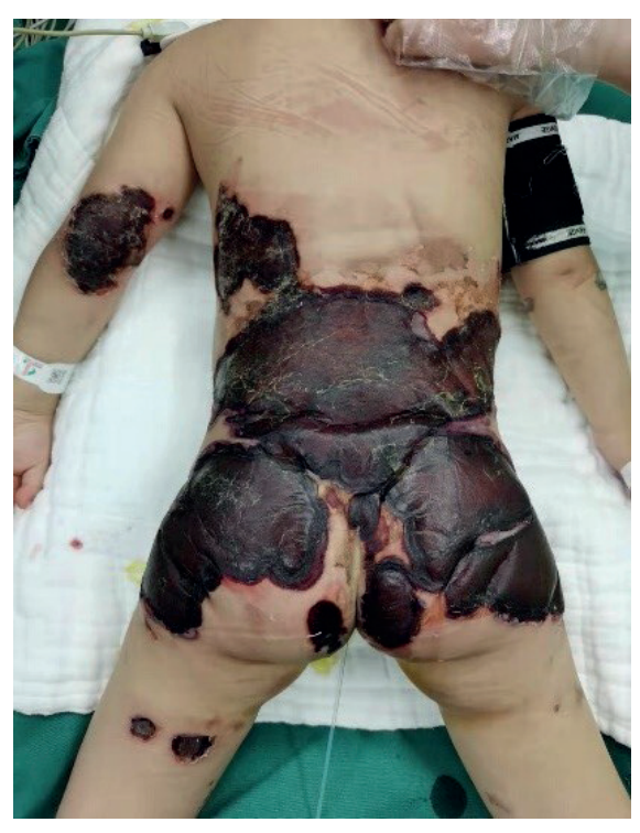
Fig. 1. The patient's wound at the time of admission.

Gastroscopy and Embolization for Post-Burn Stress Ulcer